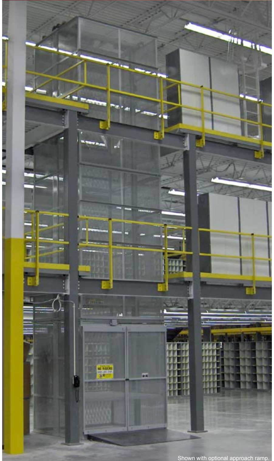
Shown with optional approach ramp.